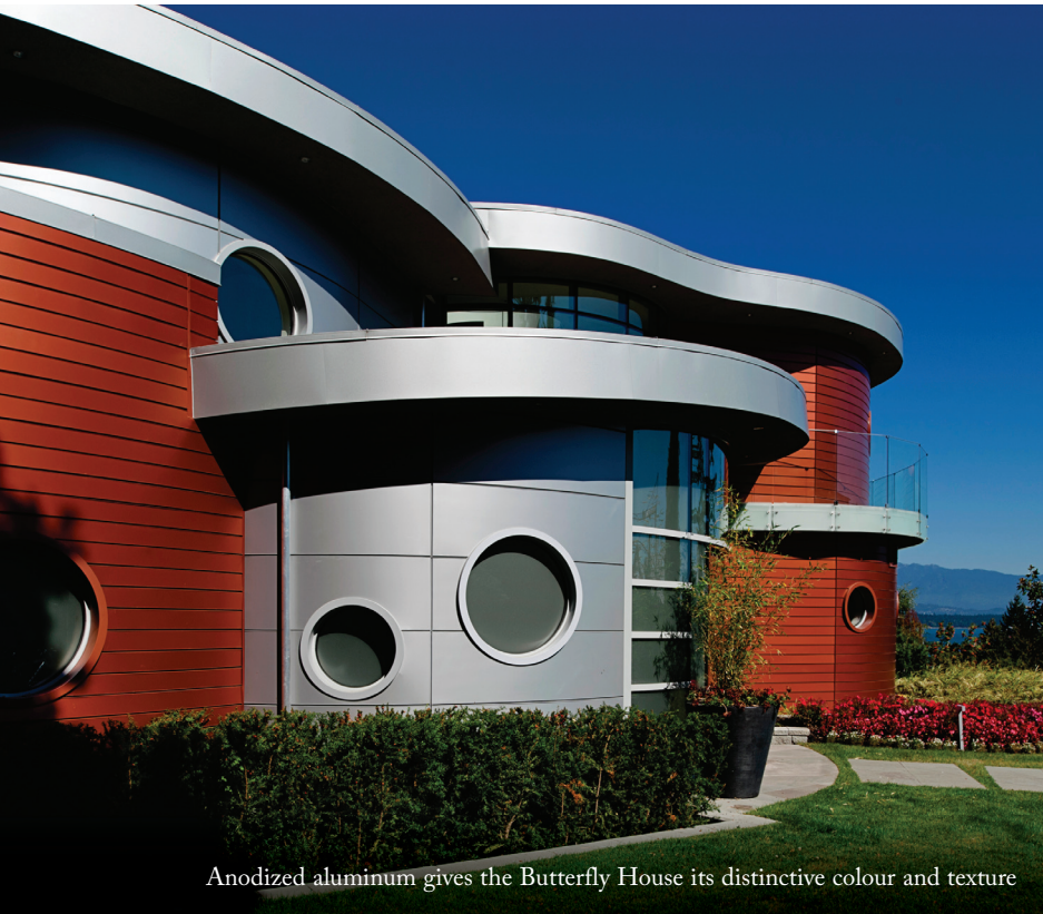
Anodized aluminum gives the Butterfly House its distinctive colour and texture