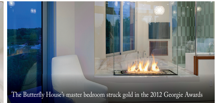
The Butterfly House's master bedroom struck gold in the 2012 Georgie Awards