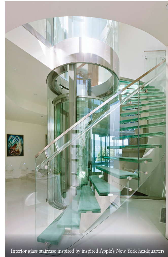
Interior glass staircase inspired by inspired Apple's New York headquarters