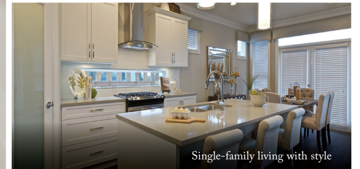
Single-family living with style